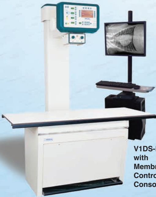
V1DS-M with Membrane Control Console

Digital imaging has become the standard for veterinary practices. Our 14 x 17" digital system is one of the most cost effective and reliable solutions. A very modest investment provides cutting edge technology that enhances soft tissue, delivers instant acquisition of the image for review and evaluation, eliminates the need for film, chemistry and filing envelopes, gives convenient access to historical patient images, enhances client education and electronic sharing of images for referral groups. The benefits are endless.